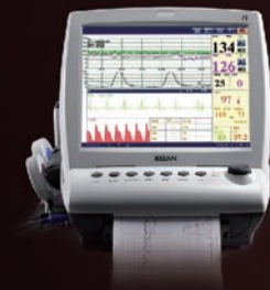
F9 Series Fetal & Maternal Monitor